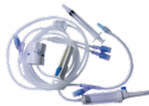
Safe IV 1Way, 2Way, 3Way