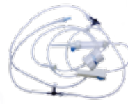
Complete IV Set