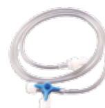
3 Way Stopcock Set