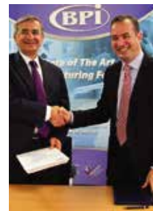
University of Balamand Cooperation agreement in the field of Therapeutic Biotechnology