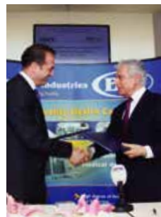
Lebanese American University Industrial Pharmacy Program Rotation