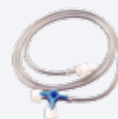
3 Way Stopcock Set