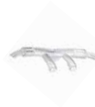
Flared Tip Sizes: Adult, Child, Pediatric