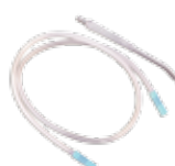
Yankauer Suction Set Crown/Round Tip Sizes: 1/4" - 3/16" 180/270/300/360 CM