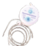
PVC Closed System Spring Type Sizes: 7 → 19 Fr / 400 ML