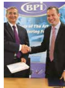
University of Balamand Cooperation agreement in the field of Therapeutic Biotechnology