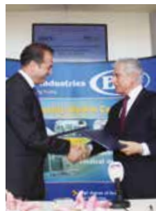
Lebanese American University Industrial Pharmacy Program Rotation