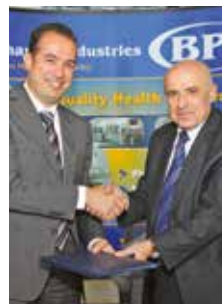
Lebanese University Masters Degree in Pharmacology and Pharmaceutical Industry